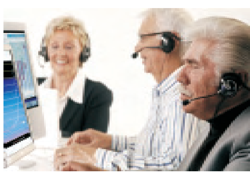
If Europe intends to plug into the knowledge economy, everyone should become a lifelong learner and innovator.

to enhance awareness of workplace learning and its benefits, the role of social partners has thus to be promoted.<sup>23</sup> Successful vocational training schemes are often based on partnerships between business, the public sector, social partners and local third sector organisations. Those partnerships should be supported in particular in several Central and Eastern European and candidate countries, have only a short tradition of industrial bargaining due to the complete reorganisation of the economy after the collapse of the Communist regimes. In some rural regions of Turkey, for instance,