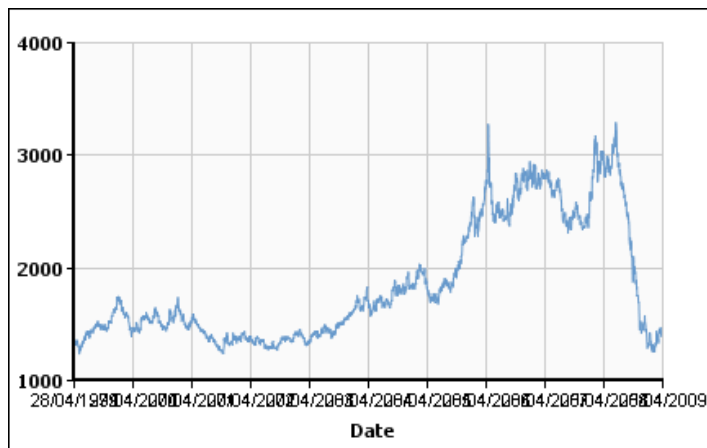
Figure 3. World Aluminium Prices, 1999-2009

Source: London Metal Exchange at http://www.lme.co.uk/aluminium_graphs.asp (accessed 27 April 2009.)