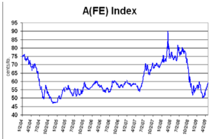
Figure 1. World Cotton Prices, 2004-9