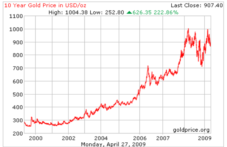
Figure 2. World Gold Prices, 1999-2009

Source: Gold Price Australia, at http://goldprice.org/charts/history/gold_10_year_o_usd.png (accessed 27 April 2009.)