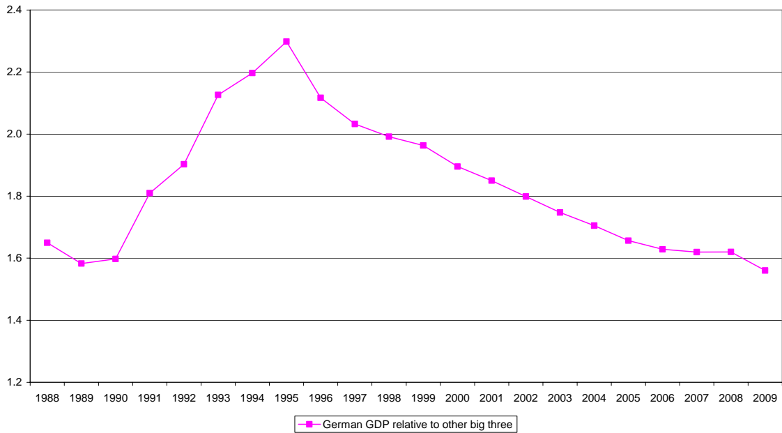
Figure 2. Germany waxes and wanes vis-à-vis the rest of euro area