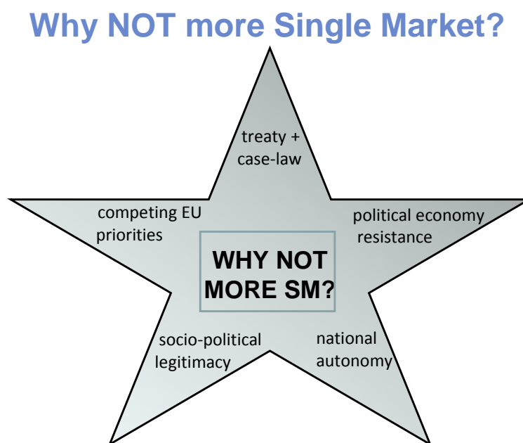
Figure 2. Why NOT more Single Market?

The unique virtue of EC1992 was that the internal market imperative at the time was too overwhelming to be easily questioned. The walls of many protectionist or anti-competitive ‘Jerichos’ were tumbling down, to wit, insurance, selected national quotas against Japanese cars, scheduled air transport, the national inward-looking bastions of veterinary and phyto-sanitary protection, exchange controls and a range of smaller ones. It is illusionary to expect such a consensual drive to take place again. But sustained political ownership of an ambitious programme by the Commission and the European Council would at least be very helpful to minimize or overrule such resistance.