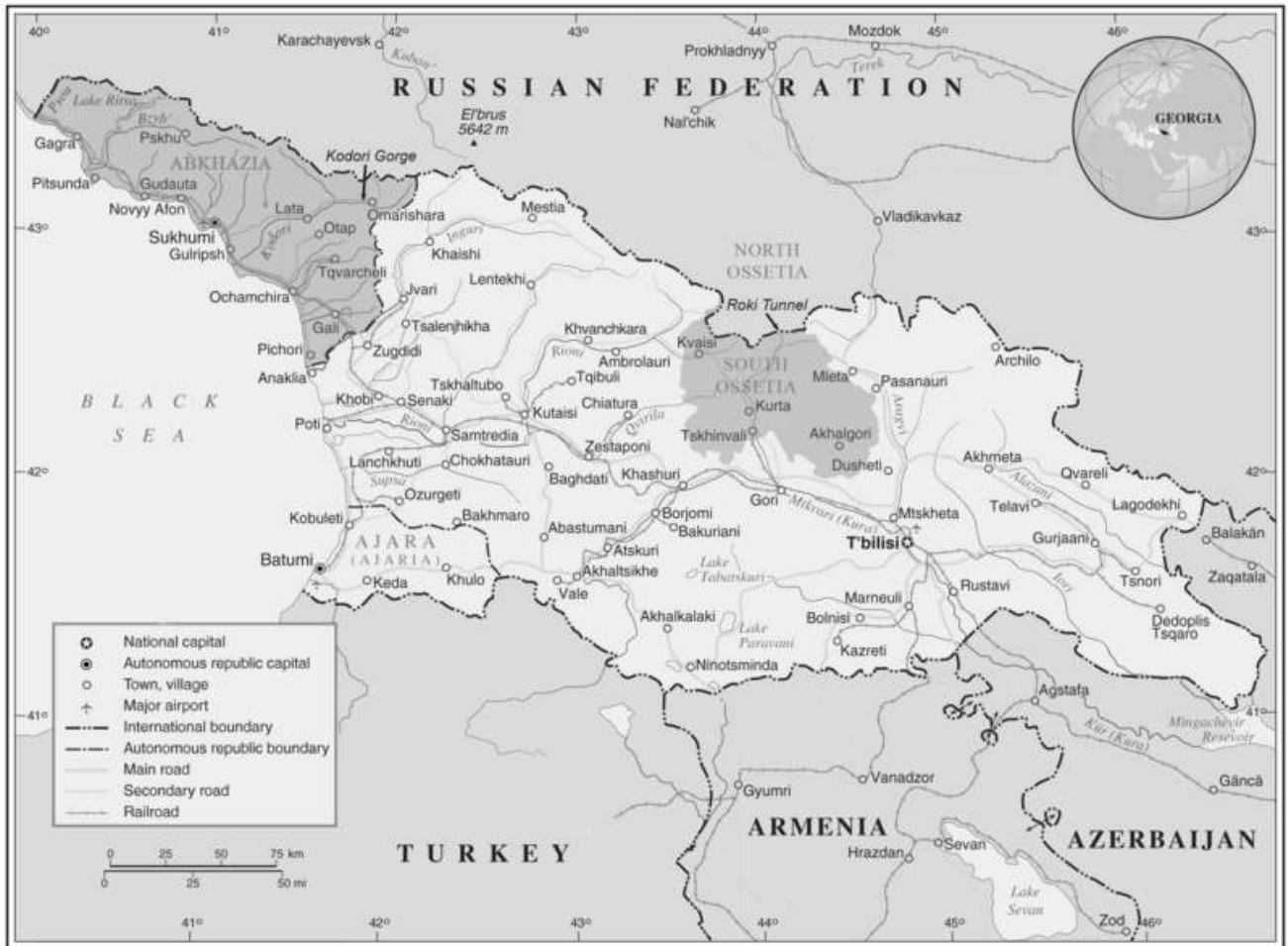
A map of Georgia showing the breakaway territories of Abkhazia and South Ossetia (shaded) in the aftermath of the August 2008 Georgia-Russia war (Source: public domain).

Cover Photo: The Rose Revolution: demonstrations at the Mayor's Office, Freedom Square, Tbilisi, Georgia, 2003. (Source: Government of Georgia Official Photo, released into the public domain)