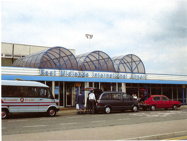
East Midlands International Airport.