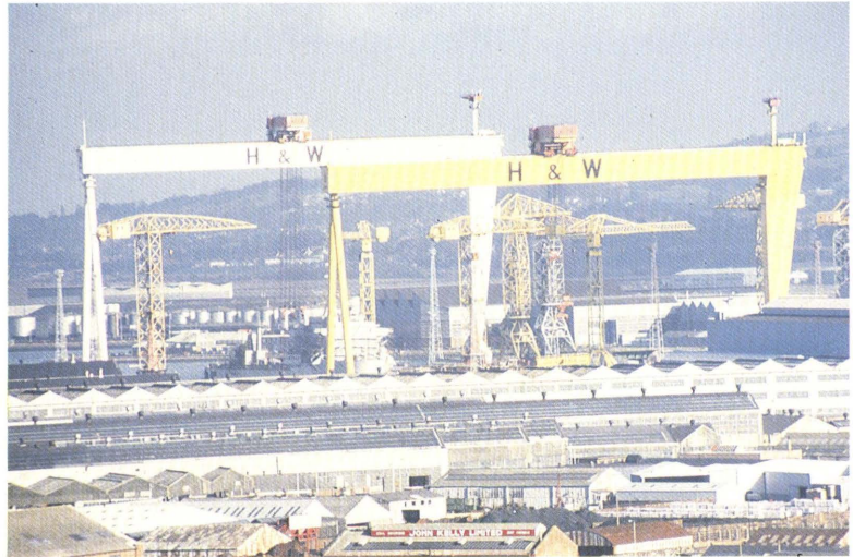
Belfast skyline (Harland & Wolff).

Within the European framework, Harland and Wolff have benefited from agreed intervention funding towards accepting new orders, paid by Government, and an agreement on the launch aid needed for privatisation. Shipbuilding in Belfast now differs dramatically from the labour intensive diversified organisation of the 1970s.