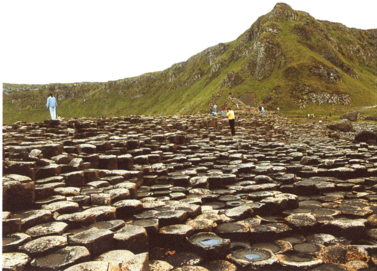
Giant's Causeway.

The term "European Union" stemming from the Treaty agreed at Maastricht is preferred in this text. However, whenever funding programmes or policies/laws stemming from the original EEC or ECSC treaties are referred to the term "European Community" is used.