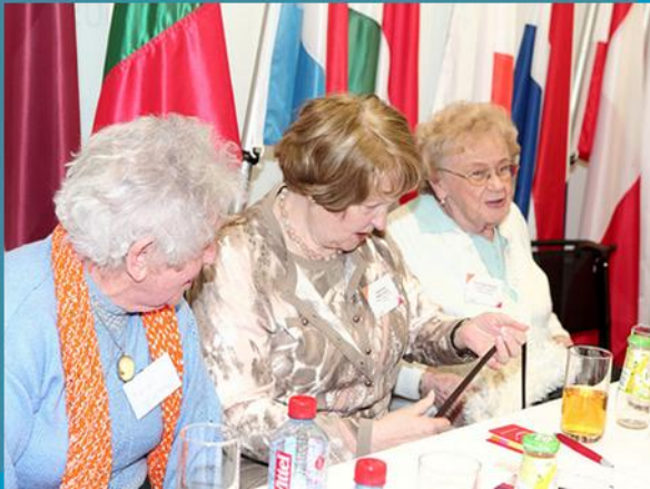
Photo: Participants in the Luxembourg 'Get Involved' Event, European Year for Active Ageing and Solidarity between Generations 2012, in Luxembourg, 7 March 2012.