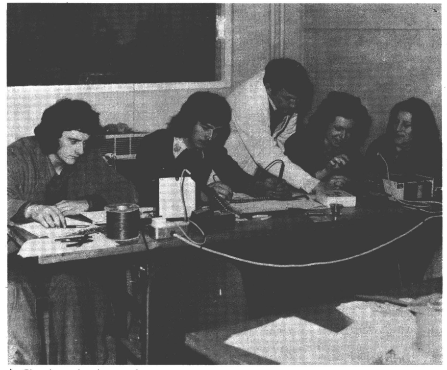
\triangle Circuit testing instruction.

Another programme for young unemployed school leavers is the Career