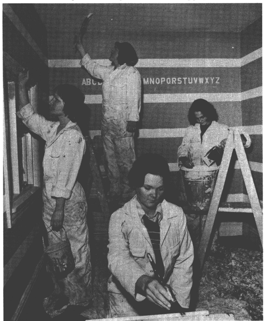
Painting and decorating — an AnCO training project for women. \bigtriangledown