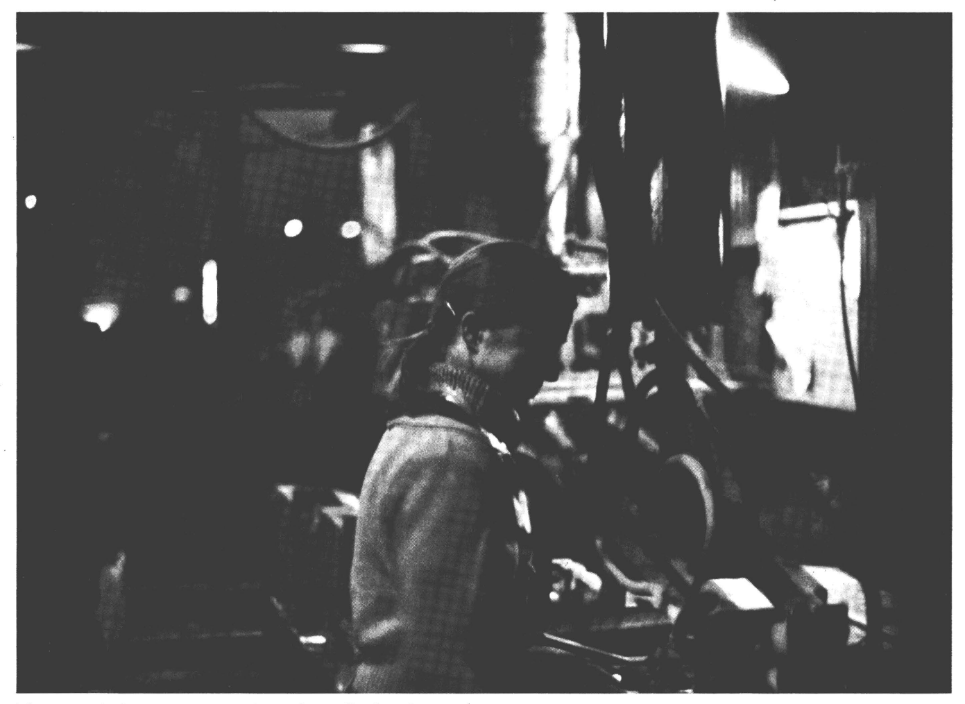
The ESF aids female access to jobs traditionally done by men.

All applications are examined by the Commission's staff, firstly to determine whether they comply with the conditions of eligibility as prescribed in the legal texts and secondly to classify them in the appropriate priority level in accordance with the criteria set out in the Commission's guidelines for the management of ESF. Some years ago the legally prescribed eligibility conditions were in themselves virtually sufficient as a basis for selection. The volume of applications has since risen dramatically