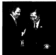
ASEM2 Chairman Tony Blair shakes hands with Korean President Kim Dae-Jung whose nation will host ASEM3 in the year 2000

The first Asia-Europe Meeting (ASEM), held in Bangkok in March 1996, established a new forum for countries in the two regions to step up cooperation in the economic, political and cultural fields. London is the venue for the second ASEM in April 1998, continuing the process of dialogue and cooperation between the governments, businesses and peoples of the two regions.