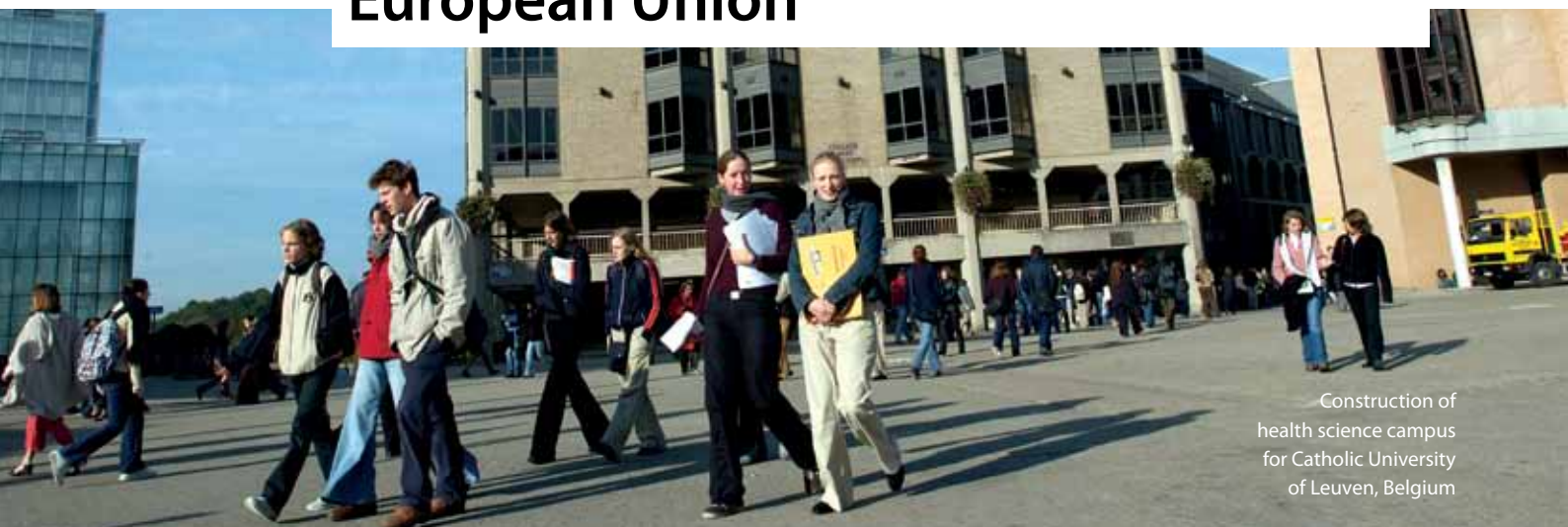
Construction of health science campus for Catholic University of Leuven, Belgium

KE Knowledge economy TEN-T TEN Transport CSE Competitive and secure energy SME SMEs-Midcaps UR Urban renewal and regeneration - Health EP Environmental protection RE-EE Renewable energy and energy efficiency ST Sustainable transport C Convergence CA Climate action