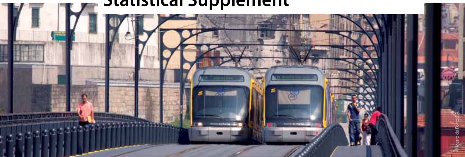
Metro do Porto II