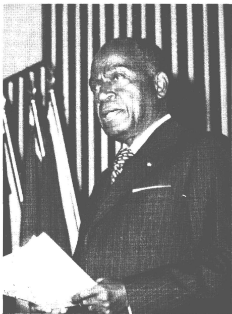
Mr Houphet-Boigny, President of the Ivory Coast Republic opens the Conference

Mr Berkhouwer, President of the European Parliament and Vice-President of the Conference, examined the effects of the energy crisis on the Community and on the Associated States. He declared that they should not, however, be over-dramatized, since they would not prevent Europe from increasing its contribution to development aid. Referring to the negotiations for the renewal and enlargement of the Association, Mr Berkhouwer confirmed that the Community and the Member States had constantly shown their firm resolve to bring about a successful conclusion. He expressed his conviction that the solution would be most original and constitute a major element in resolving the problems which might arise between groups of countries at different stages of development.