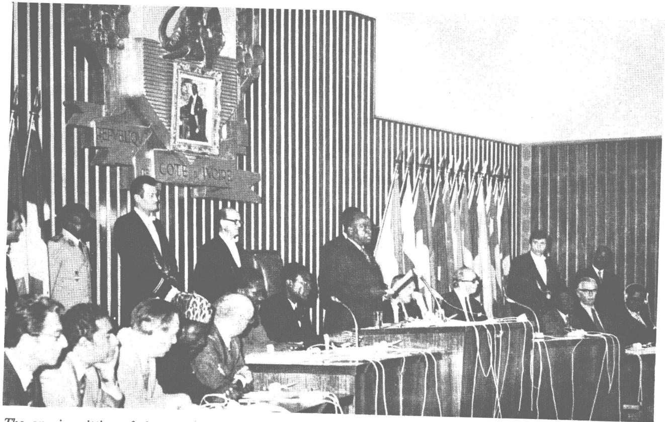
The opening sitting of the Parliamentary Conference. Mr Houphet-Boigny, President of the Ivory Coast Republic, between Mr Yacé and Mr Berkhouwer, President and first Vice President of the Conference