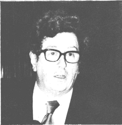
Mr FitzGerald, President of the Council of the European Communities.