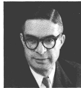
Chief negotiator at the GATT: EEC Commissioner Jean Rey

Speaking of the renegotiations under Article XXIV (6) of the GATT—first part of the current negotiations in Geneva—Mr. Rey said that their sole purpose was to translate into the common tariff, and on an equivalent level, the