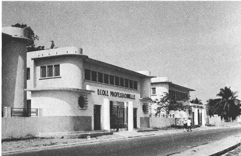
New school in Douala, Cameroon, is typical of social projects receiving aid grants from the Common Market's Overseas Development Fund.

The two new quays, required for the extension of forestry and mining operations in Ogowé, will give the harbor a total of seven. They will be built after a public call for tenders and, though financed by the Development Fund, will become the property of the Congo Republic (Brazzaville).