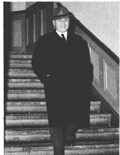
Jean Monnet heads 40-member Action Committee from his headquarters in Paris.

The Committee notes that the less-developed countries are incapable today of advancing by their efforts alone the prospects and living standards of their areas of the world. Such improvement is a vital factor in achieving world equilibrium which would be the basis for easing East-West tensions.