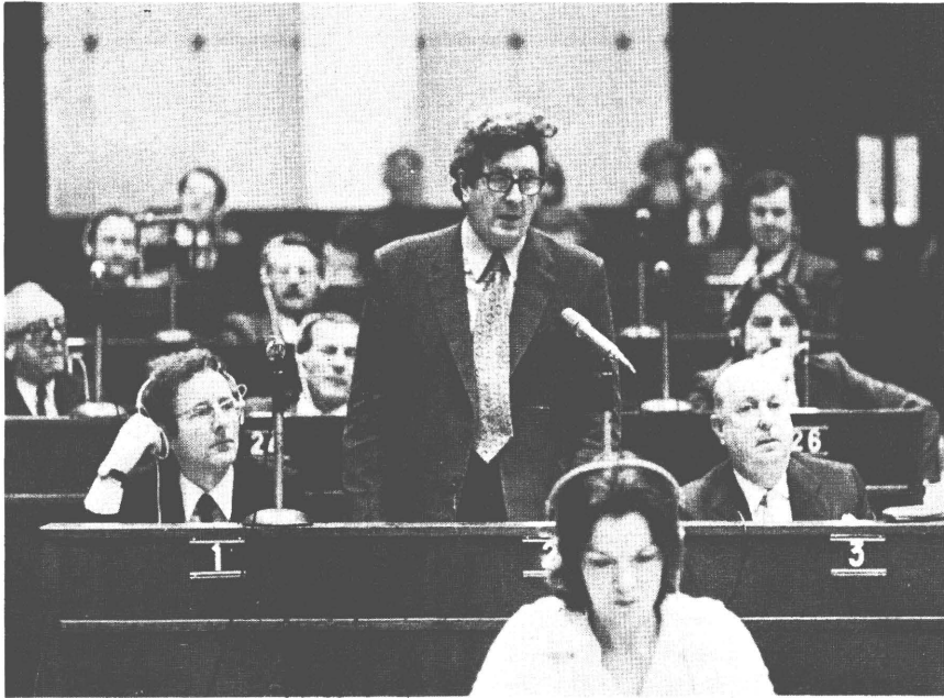
Mr Garret FitzGerald, President of the Council, reports to the House on the Dublin meeting of the European Council

early next week. That Cabinet will take a decision on the recommendation that it is to make to the people of the United Kingdom about continued British membership. It is clear that if the Cabinet decides in favour of a recommendation to the effect that the United Kingdom should remain a member of the Community, the Prime Minister will press home that recommendation to the British people; but of course, the decision as to what recommendation to make must be taken by the British Cabinet.