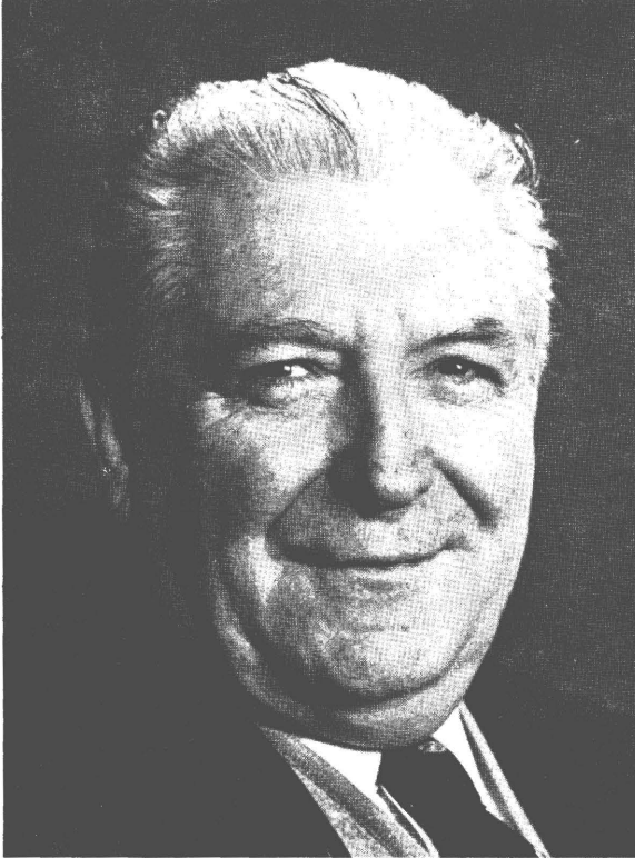
Mr Georges Spénale is elected President of the European Parliament

Parliament's year begins on the Second Tuesday in March and its first act, in every second year, is to elect a new President. The re-election of the President at the end of the first year is usually a simple formality. The term of office of President Cornelis Berkhouwer ended on Monday, 10 March and Mr Roger Houdet, the senior Member and, as he put it, 'the only one to have a foot in the