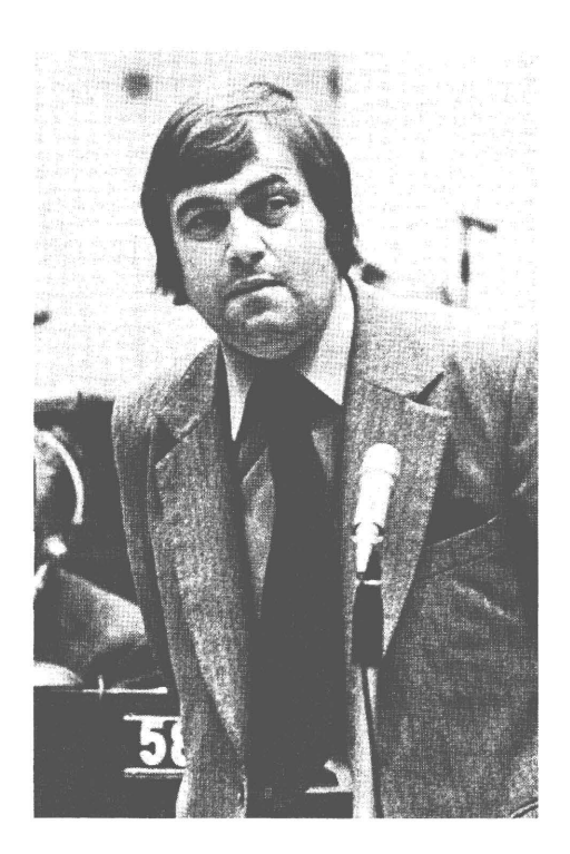
John Prescott: 'If we do not make these huge cooperations accountable to us, governments and states will be made accountable to them and so destroy democracy'.

corruption'. Such acts, he believed, contravened Articles 85 and 86 of the EEC Treaty (distortion of competition, abuse of a dominant position by undertakings). He proposed a number of specific measures, including the formulation of EC rules for multinationals, an investigation by the Commission's DG4, and an EP equivalent of the US Senate's 'Church comittee'.