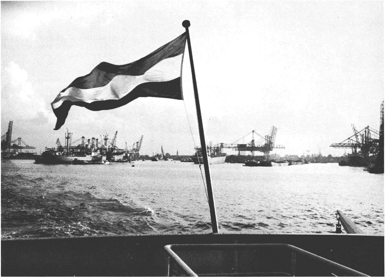
Holland Looks Outward: The flag of the Netherlands marks one of the world's largest ports. In 1962, Rotterdam Harbor handled 95 million metric tons of merchandise. Its shipping capacity of refined petroleum was established in 1960 at 24.7 million metric tons.