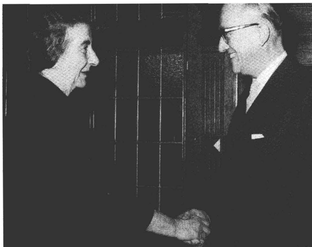
Israeli Discussions Continue: Israeli Foreign Minister Golda Meir met with EEC Commission President Walter Hallstein, March 9 in Brussels.

The 12-year loans carry a 6¾ per cent interest rate. Including this loan, the High Authority has raised a total of $402.4 million for investment finance since 1954.