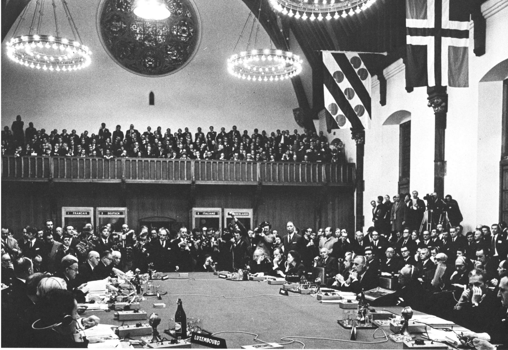
Members of the press and spectators crowd the gallery and room where the heads of state and government, seated at the conference table, 'held the two-day summit meeting in the Knights' Hall, The Hague.