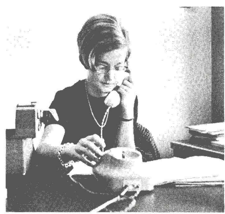
Direct dialing, improved equipment, and investments of $40 billion between now and 1985 should cause a swift increase in both domestic and international phone calls.

During the 1969-85 period, inter-city calls should increase fivefold, and international