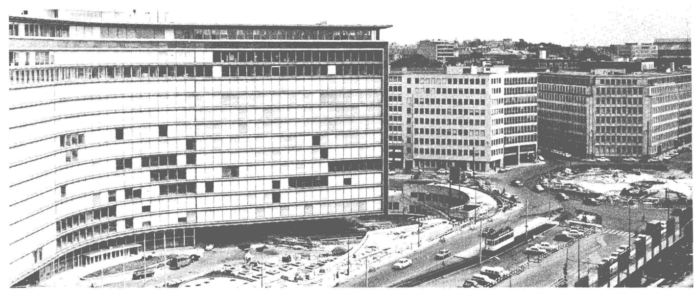
The Christmas marathon kept lights burning at the Commission's headquarters on the Rue de la Loi as well as at the Council's headquarter across town on the Rue Ravenstein.

on details. The French, for example, gave more than they would have liked on the Parliament, which will now in theory have the last word on the Community's budget instead of the Council. France will initially pay a higher share of the cost of the farm fund under the new system, and transitional measures will continue longer than the French would have liked.