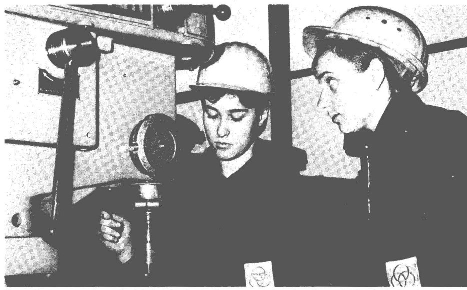
Young Germany receive on-the-job training by serving as apprentices in a Krupp steelworks factory in

The Commission has outlined guidelines for the dismissal of workers in member states and common policies to reduce unemployment among youths.