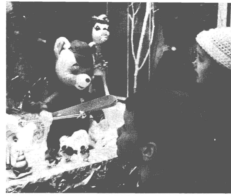
Even the smallest European consumers benefit from Common Market integration, which expands the choice of goods available, increases quality, and, in some cases, lowers prices.

The entry of Norway, Denmark, and Britain, which have made great advances in consumer action, could give greater weight to the consumer viewpoint in the work of the Commission and the Council. Things may be looking up for the EC consumer.