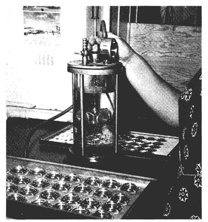
Watches labeled "Swiss made" may contain foreign imported components and labor worth up to 50 per cent of their total value, if they meet Swiss performance standards. Here waterproof watches are being tested.

the Swedish tariff is lower than the Community's common external tariff.