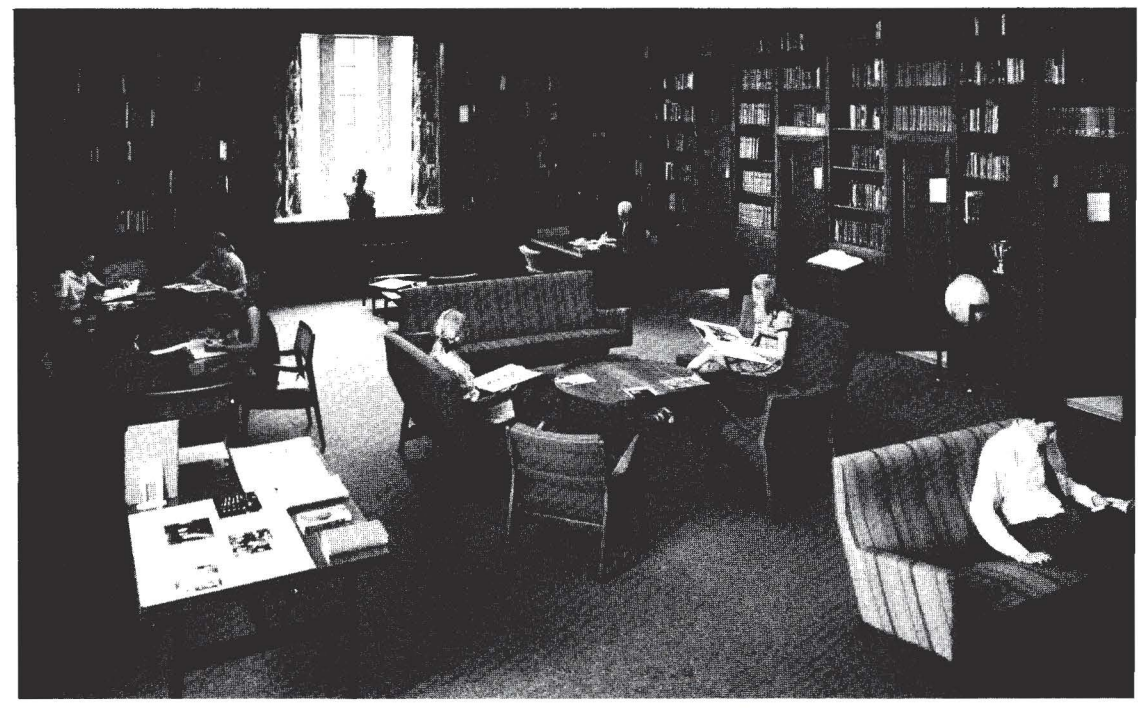
Students and researchers using the Marshall Library's collection can draw on General George C. Marshall's personal papers, taped interviews, and 15,000 volumes on twentieth century military and diplomatic history.

The bulk of the budget, 81 per cent, will go to the common farm fund to support prices and modernize agriculture. The Community's administrative costs will account for less than 5 per cent of the total outlay, the Commission said.