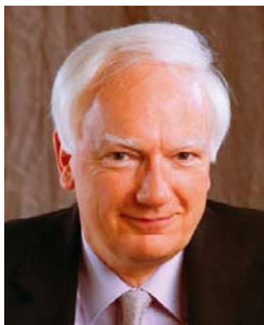
Philippe Maystadt, President of the European Investment Bank Manager of the Trust Fund