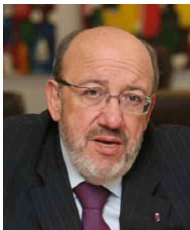
Louis Michel, Commissioner for Development And Humanitarian Aid European Commission as Founding Donor

We also wish to reaffirm our resolve to contribute actively and effectively to the reinforced EU-Africa Partnership, and our commitment to making a success of the Trust Fund, in close cooperation with the donors from the Member States, the bilateral European institutions, and our African partners.