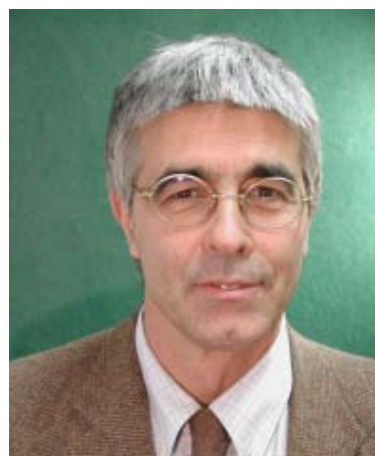
Lluís Riera, Co-chairman of the Steering Committee of the EU-Africa Partnership on Infrastructure

In order to achieve the ambitious goals related to the effective development of African infrastructure for a sustained growth, the Steering Committee of the EU-Africa Infrastructure Partnership will work together with other initiatives, actors and instruments, such as the Infrastructure Consortium for Africa, the emerging donors and the private sector.