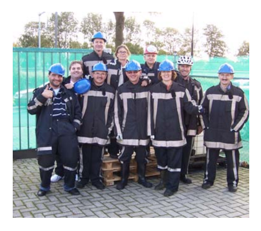
The JRC-IE BHV emergency team

At the level of the Petten research location, collaboration between the different companies and institutes on-site has taken place to prepare and execute site emergency exercises. Lessons learnt during this process are implemented.