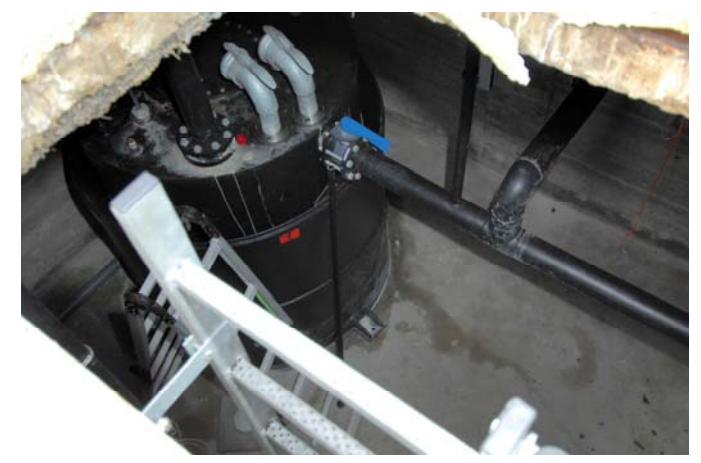
Waste water tank

The release of heavy metals and relevant inorganic emissions to the drain system is given in the table below. The measurements are performed by one external company for all the Petten site organisations at different locations within the ECN part of the site where these drains all get together. The drain system has been changed in 2008, before that the measurements also included the waste water coming from the HFR. Now there are separate measurements for the HFR and JRC-IE, but the combined measurements for 2008 give results comparable to those of previous years.