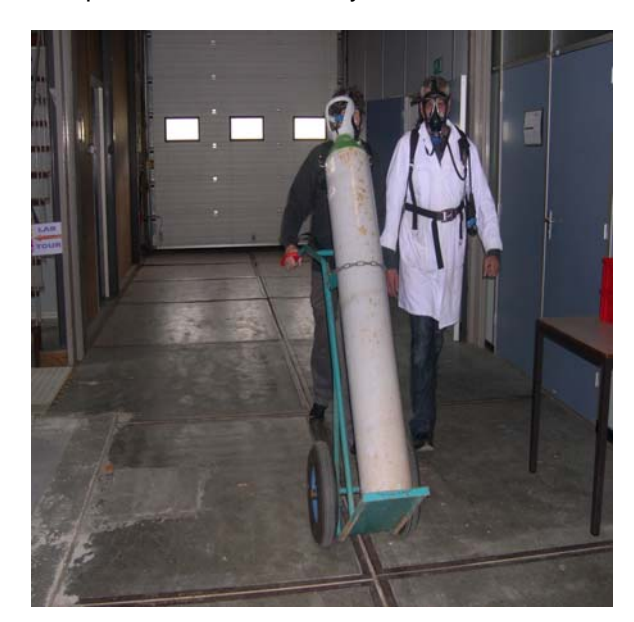
Self-Contained Breathing Apparatus (SCBA) Training

To keep staff updated and to increase awareness, representatives of the SES sector provide information on safety and/or environment related matters during Unit meetings. The SES also organises so called toolbox meetings to specific groups of staff members like laboratory managers, in line with the requirements of our safety and environmental management systems.