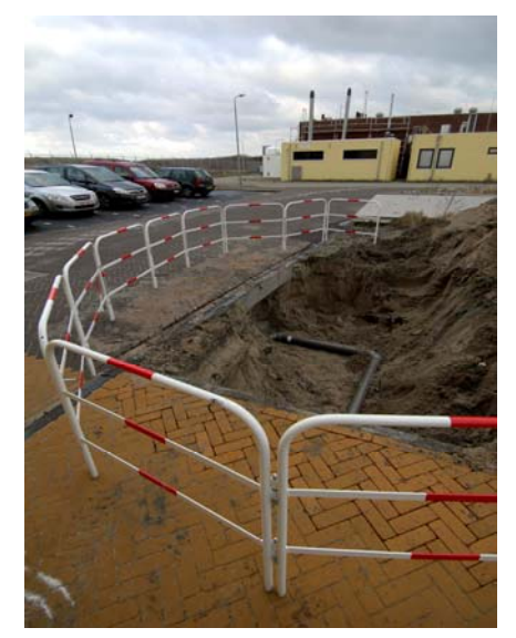
Example of excavation work at JRC-IE for which a work permit is required.

December) and 6 in 2009 corresponding to 7% and 4% of the total number of work permits granted in the respective period, showing an increased compliance with the safety system.