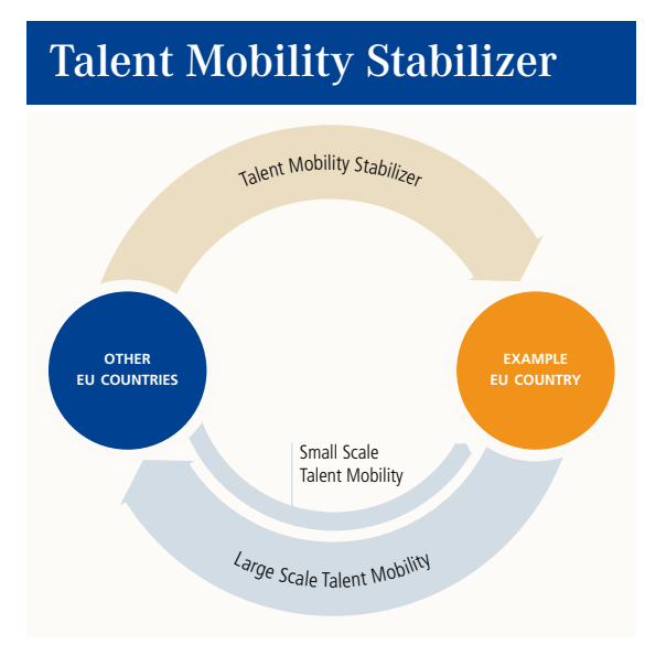
A European fair deal on talent would be composed of a short term Talent Mobility Stabilizer. This would be an economic package administered at the EU level. EU benchmarks such as EU labor mobility flows, youth unemployment rates and economic growth forecasts could provide an evidence base to govern the stabilizer. In the short term, EU countries that are net beneficiaries of talent could aid EU countries lending domestically-matured talent to their neighbors. Such an economic package would be earmarked to benefit measures that develop the talent pipeline and reduce unemployment.

A European fair deal on talent would enable countries losing talent to better develop their