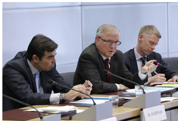
Margaritis Schinas, Vice-President Olli Rehn and Philippe Legrain, at the seminar on populism, organised by BEPA on 25 April.

The social media have dramatically lowered the entry barrier to the public debate: they can and do shape new agendas (the campaign against ACTA is a case in point), provide new fora for discussion, and cast new light on how and where political views are formed in the 21 st century. Here lies not only a risk but also an opportunity: lacking (still) a common European public space, why not make better use of a quintessentially cross-national cyberspace to fill the vacuum that an increasing number of EU citizens feel in terms of political participation and democracy? It is notably this vacuum that populist forces are trying to fill these days – with some success.