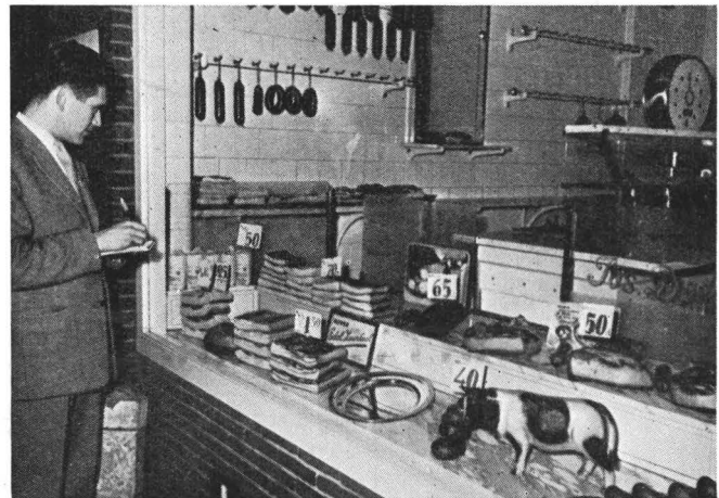
Comparing prices during a High Authority Social Survey designed to compare real wages in Community countries.

There has also been a steady increase in all member countries in the range and benefits available under schemes of social security. More and more sectors of the population have been brought into the ambit of such schemes.