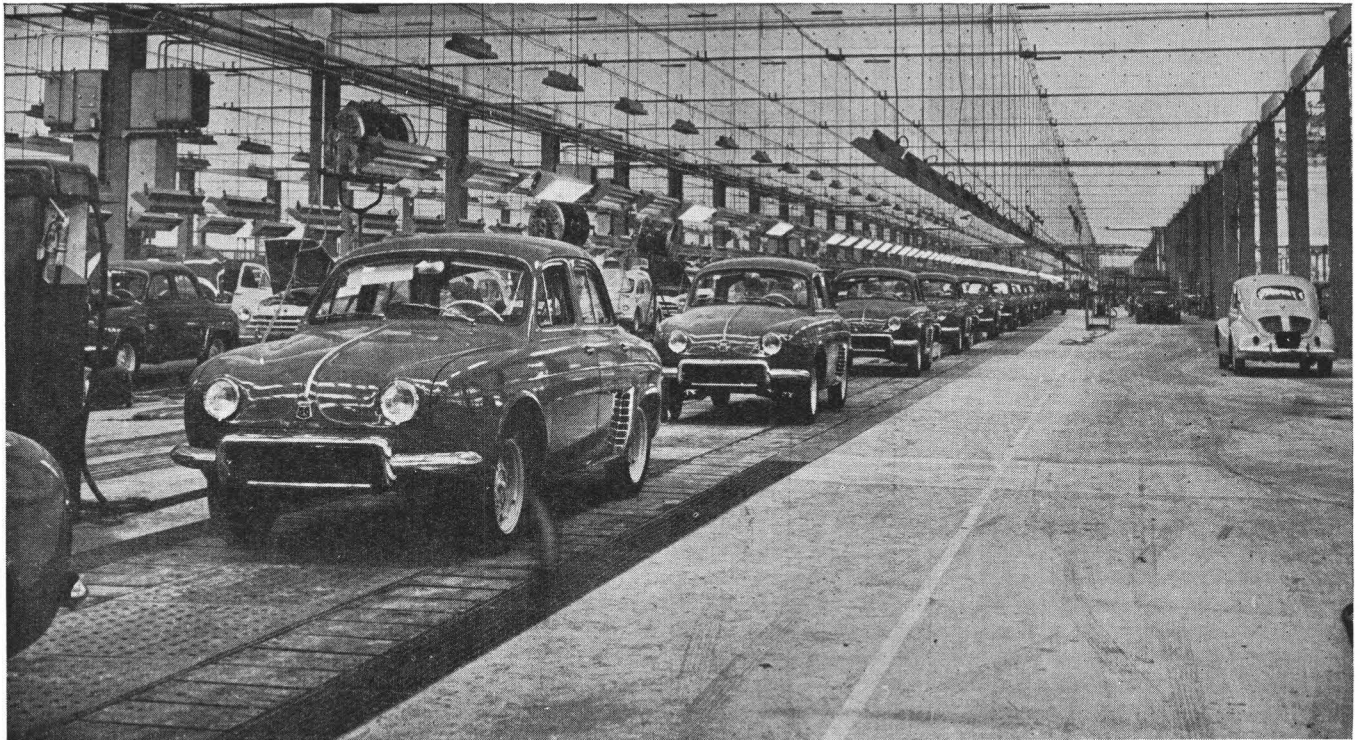
The Common Market opens up new prospects for Europe's automobile industries. Here a line of Dauphine models nears completion at a Renault factory in France.