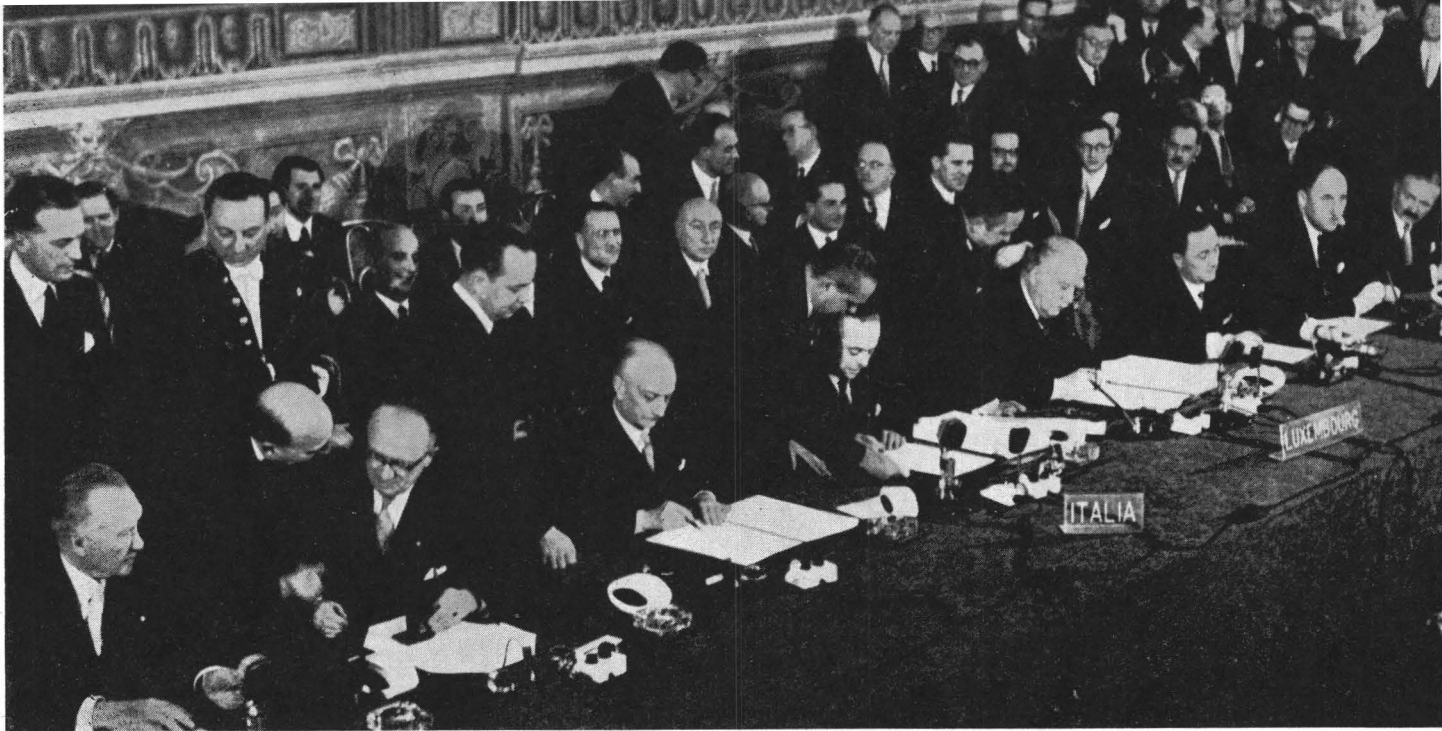
The Signature of the Common Market and Euratom Treaties, Rome, March 25, 1957.