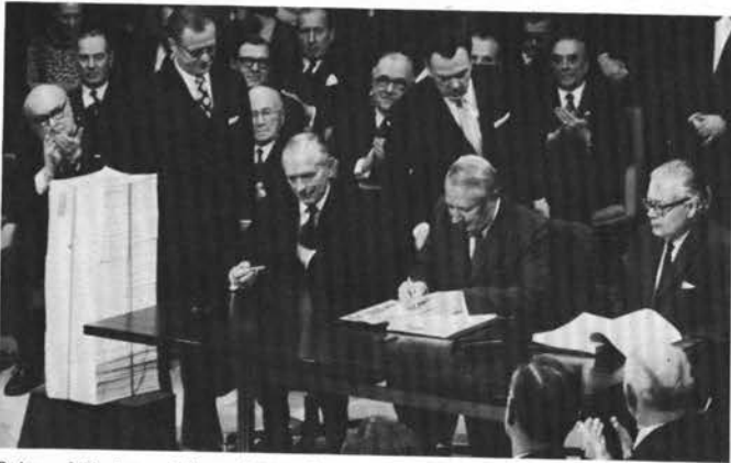
Prime Minister Edward Heath signs the treaty by which Britain became a member of the European Community. He is flanked by his Minister for European Affairs Geoffrey Rippon (right) and Foreign Secretary Alec Douglas-Home.

October 28. House of Commons accepts principle of entry into Community by 356 votes to 244.