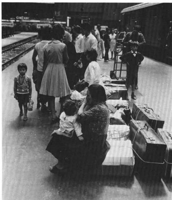
Migrant workers in Milan, Italy, wait for the train that will take them to new jobs in Germany. The Community has achieved "free movement of labor," meaning that citizens of any of the nine member countries can work in any of them without losing social security benefits.

allow companies and individuals to do business or practice a profession anywhere in the Community. They do not yet apply to every type of business, profession, or service. Here, the main obstacle to progress has been disagreement over "equivalency of diploma," over whether a German engineer's diploma guarantees training at least as complete as a Belgian diploma, for instance.