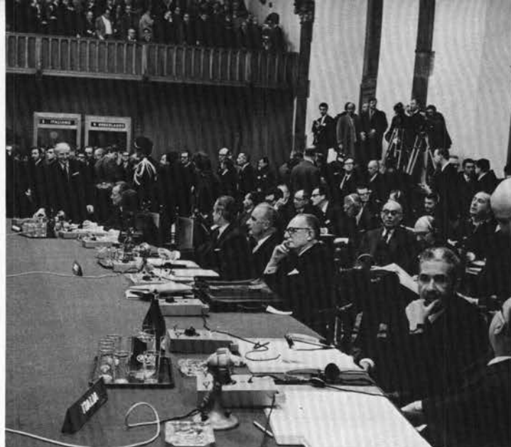
The movement toward political unification was revived at this Summit meeting in December 1969 at the Knights' Hall, The Hague.

The heads of state or government, having set themselves the major objective of transforming, before the end of the present decade and with the fullest respect for the treaties already signed, the whole complex of the relations of member states into a European union, request the institutions of the Community to draw up a report on the subject before the end of 1975 for submission to a Summit conference. Summit Communiqué, Paris, October 19-20, 1972