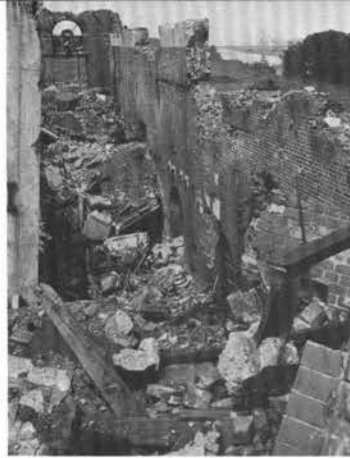
The Bonne Espérance-Logdoz factory in Chertal, Belgium, was built on the ruins of the Bonne Espérance mine which closed down. Construction of the plant was partly financed by a loan from the European Coal and Steel Community under its program for bringing new industry into declining coal and steel regions.

The European Investment Bank (EIB) is an independent non-profit public body. It lends money to financial institutions, autonomous public authorities, pub-