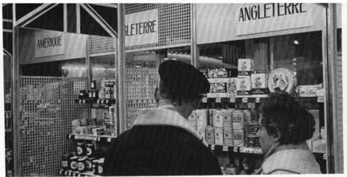
Department store, Brussels, Belgium. The Common Market has helped to raise living standards and has given the consumer a wide choice of goods from around the world.

Britain and Denmark adopted the Community's