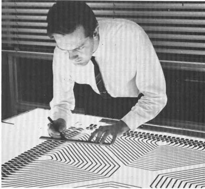
Core Memories, Ltd., Dublin. The Community's industrial policy encourages the formation of companies large enough to compete throughout the Nine and to invest in the research necessary to develop tomorrow's technology.

bank spent UA 59.3 million on partial financing of such projects. The bank gives special consideration to transnational projects when deciding upon its financing activities.