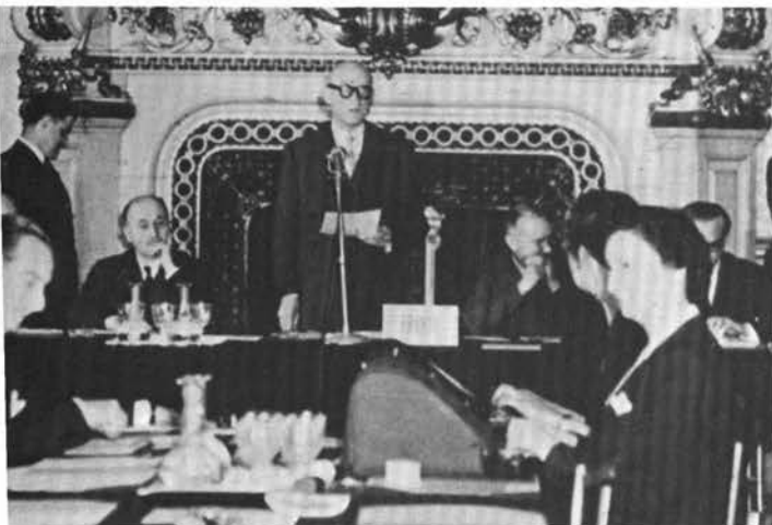
The "Schuman Declaration" of May 9, 1950, launched the first European Community, for coal and steel.

April 8. Six sign treaty merging Community executive institutions.