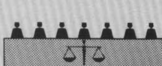
Court of Justice