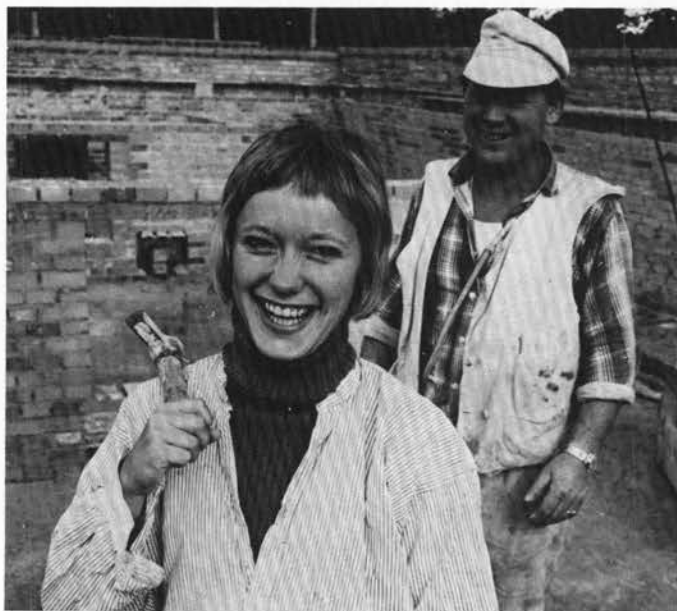
Danish bricklayers. Equal pay for men and women performing the same job is a main objective of the Community's social and labor policy.

Responding to social and labor discontent about the consumer society and mindless work in the early Seventies, the Community unveiled a social reform program in January 1974. The program stresses: job enrichment; involvement of workers in corporate