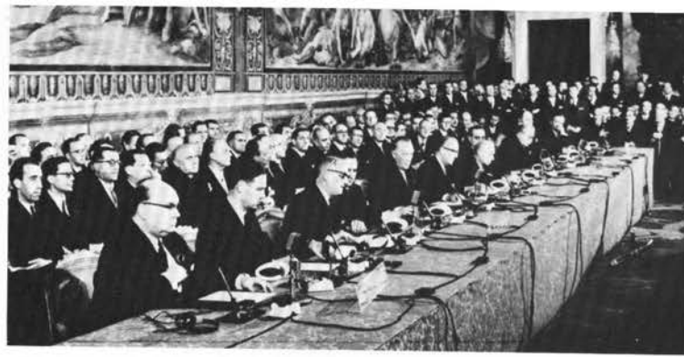
Signing of the Treaties creating the European Economic Community and the European Atomic Energy Community, Rome, March 25, 1957. The Community's six founding members pledged to achieve "ever closer union among the European peoples."

1958-73. The Common Market was to be created in stages over 12 years. By July 1, 1968, 18 months ahead of the treaty timetable, the Community had achieved free trade in industrial goods and most farm products. The Six had eliminated tariffs on intra-Community trade and had established a common tariff on imports from non-member countries. The policies that had not been completed when the transition period ended on December 31, 1969, are still being forged.