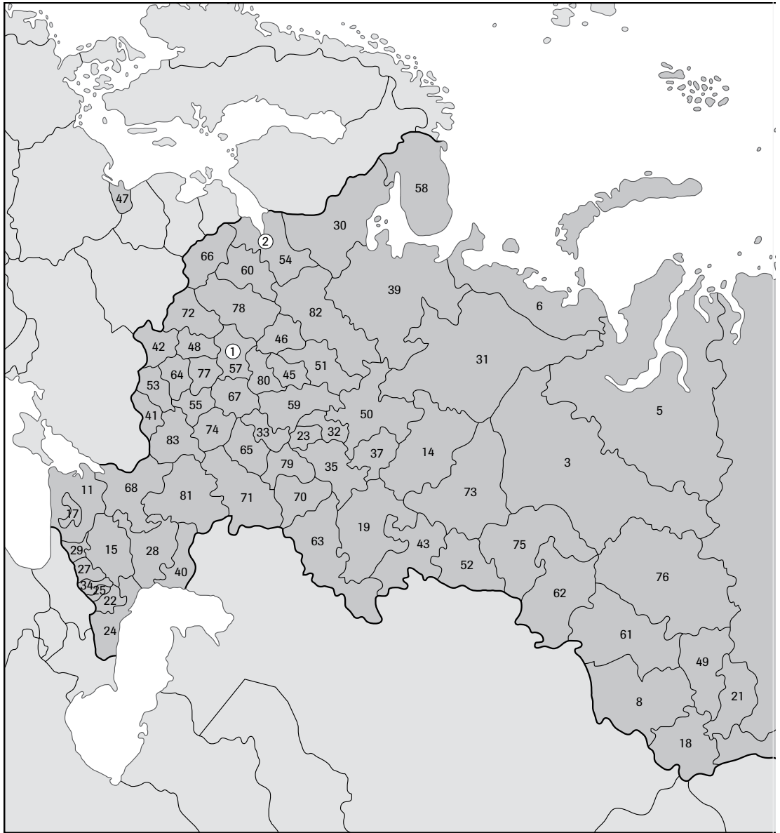
Map 1. Russian Federation – administrative division