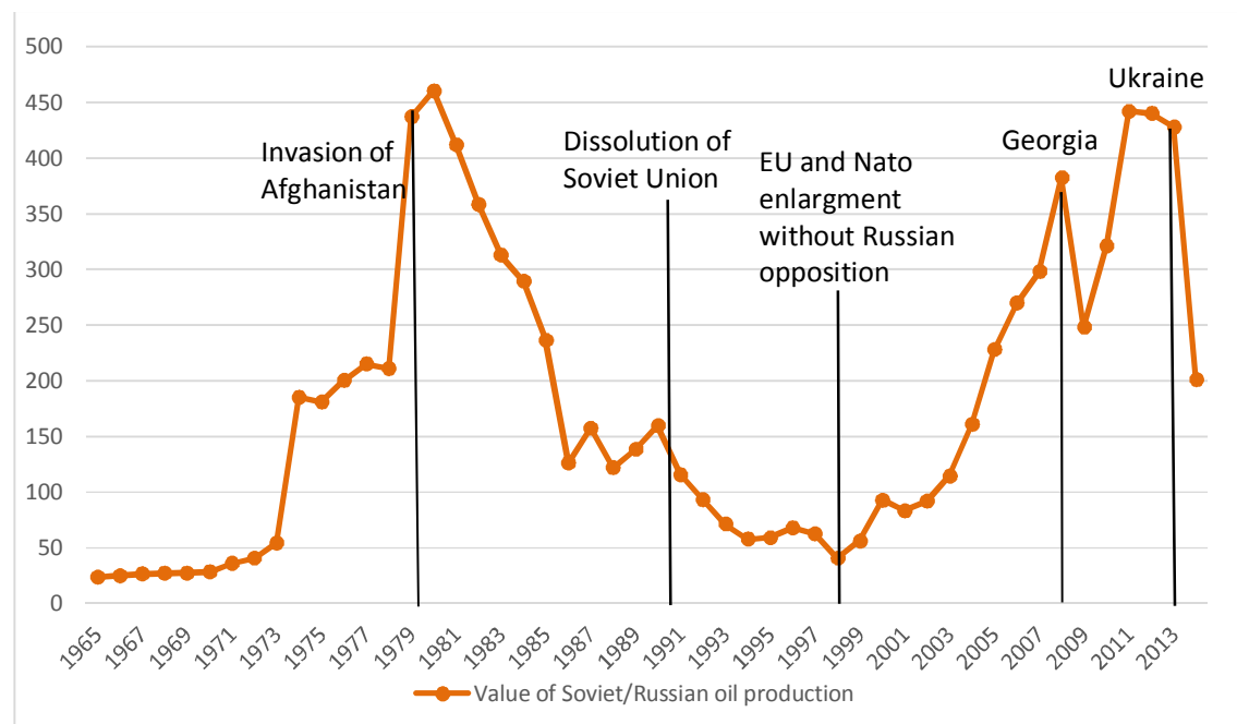
Figure 1. The value of Russia's oil in constant USD

Figure 1 shows the annual volume of Soviet and later Russian oil production multiplied by the price of oil in real terms.