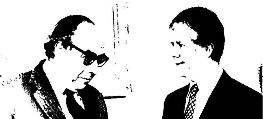
Roy H. Jenkins, President of the European Common Market is greeted by President Carter at the White House at the beginning of a meeting between the President and the European economic leader.

by its wish to help release the hostages and to consider how far suggested measures such as economic sanctions by the Community would actually contribute to that aim. It was possible that Europeans might see things slightly differently from the Americans; for example, one had to consider whether sanctions might not be counterproductive in certain cases.