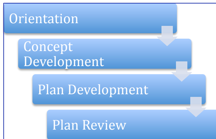
Figure 4. Crisis response planning at military-strategic level

produced in this process are thus the Concept of Operations (CONOPS) and the Operation Plan (OPLAN). The CONOPS is a concise statement of how the Operation Commander intends to fulfil his mission whereas the OPLAN is the highly detailed script of the entire operation. Both the CONOPS and the OPLAN are approved by the EUMC and politically endorsed by the PSC and the Council. This process is visualised by Figure 4 below.