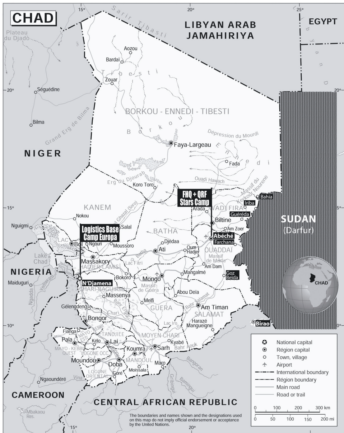
Figure 1. Map of Chad and planned EUFOR positions 9

2004 to amend the constitution and to run for a third term. 10 The ensuing political alienation revitalised armed rebellion as means to express political grievances. Yet it is also crucial to bear in mind the fractious nature of this opposition to Déby. The various rebel groups do not form a coherent force and are united only in their opposition to the current regime. The hard core of fighters with refuge on the Sudanese side of the border reportedly