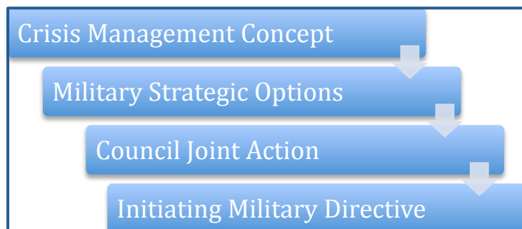
Figure 3. Crisis response planning at the political-strategic level

From this point onwards, the various headquarters (OHQ at the military-strategic and FHQ at the operational and tactical level) can kick into action. In terms of doctrine, the EU OHQ Standard Operating Procedures essentially follow the NATO Guidelines for Operational Planning. The first step is a detailed analysis of the guidance given by the level above (orientation phase). Secondly, different courses of action are developed and compared with one another (concept development). Thirdly, the preferred course is developed into a plan (plan development). Fourthly, plans receive regular reviews when they are put into practice (plan review). At the military-strategic level of the OHQ, the key documents