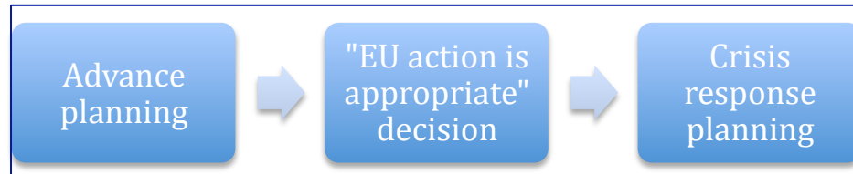
Figure 2. Operational Planning Disciplines

In order to meet the complex challenge of planning operations, military institutions have developed a body of doctrine and procedures. The ESDP structures are not different in this regard: a planning process has been developed and is regularly revised. As most EU member states are also NATO members, ESDP planning procedures are very strongly inspired or simply copied from the available NATO doctrine. This subsection sketches a broad outline of how the operational planning process works in the case of military ESDP operations. 20