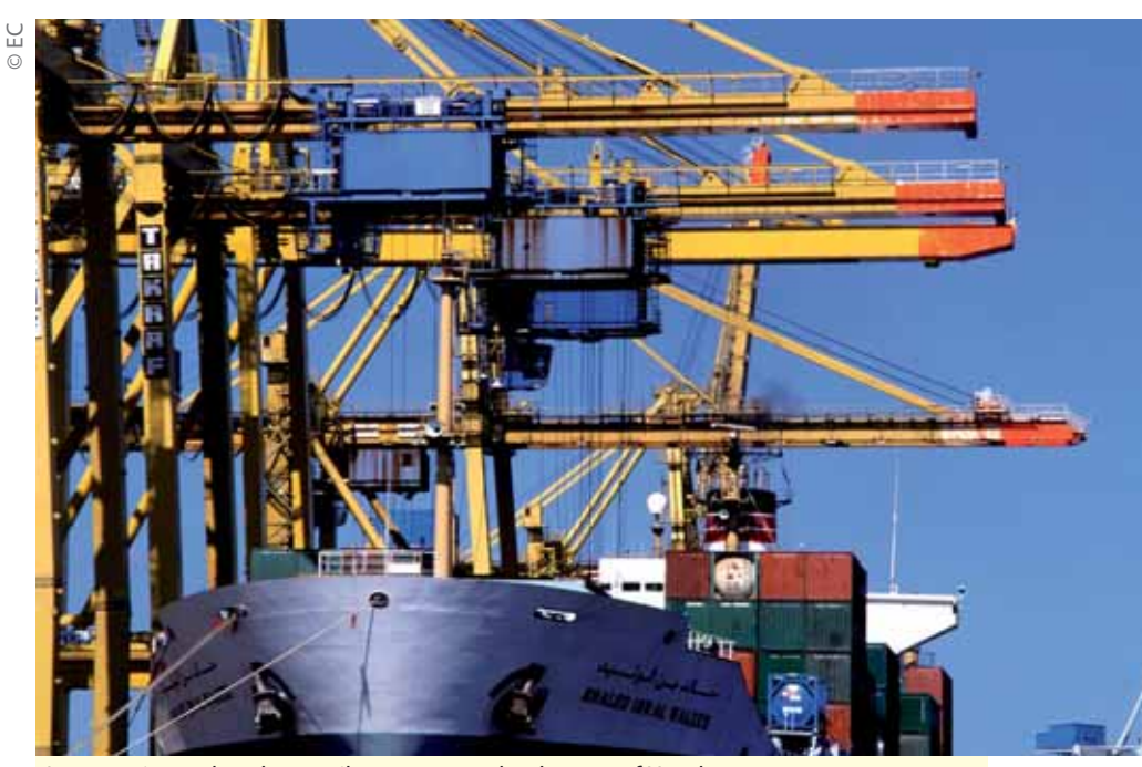
Intercontinental trade contributes to growth - the port of Hamburg

At the global level, Africa and the EU will seek to promote global economic governance, and sustain Africa's efforts to integrate into the world economy. To achieve this, the coordination of African and EU positions in international fora will be promoted. Africa and the EU will seek to join efforts to conclude the Doha Development Agenda as soon as possible. This could involve, in particular, seeking common ground to address key issues for development, such as reductions in trade distorting subsidies,