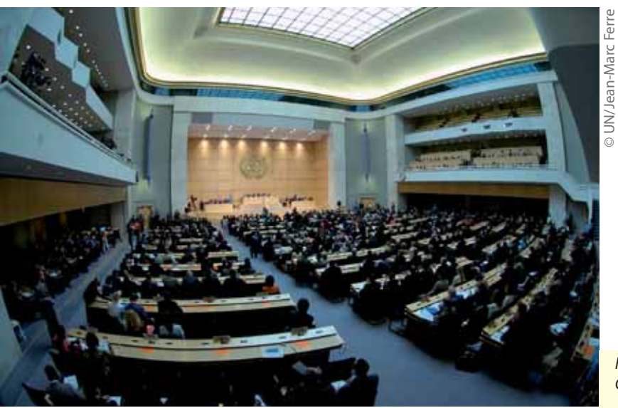
Human Rights Council, Geneva

Similarly, Africa and the EU will also work together on a global level and international fora, including in the UN Human Rights Council, for the promotion and protection of human rights and international humanitarian law and for the effective implementation of international and regional human rights instruments. Both sides also commit themselves to