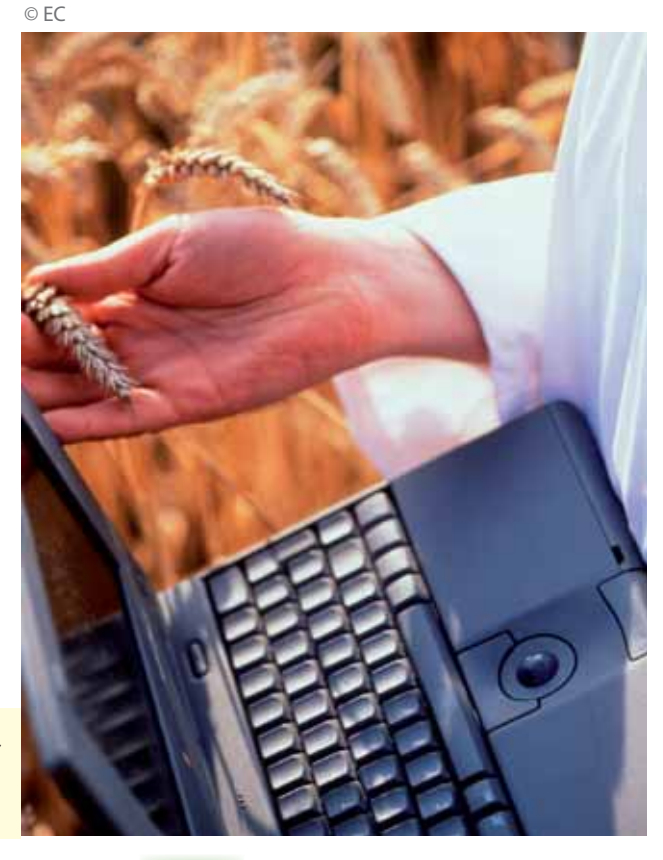
Strengthening the quality control of agricultural products to ensure food security