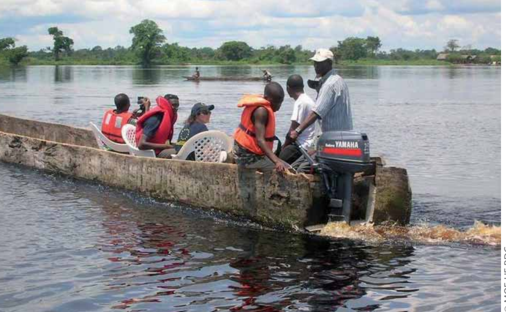
The Election Observation Mission (EU EOM) in the DRC — European observers travelling to a polling station — Mbandaka on the River Congo