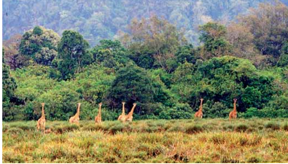
Preserving biological diversity is a priority of cooperation