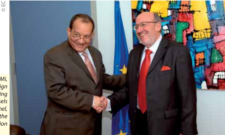
Mr Ahmad Allam-Mi, Minister for Foreign Affairs of Chad, being welcomed in Brussels by Mr Louis Michel, Member of the European Commission

Under the leadership of the AU, the African Peace and Security Architecture (APSA) is taking shape. African peace-making, peace-keeping and peace-building mechanisms are being strengthened at the continental,