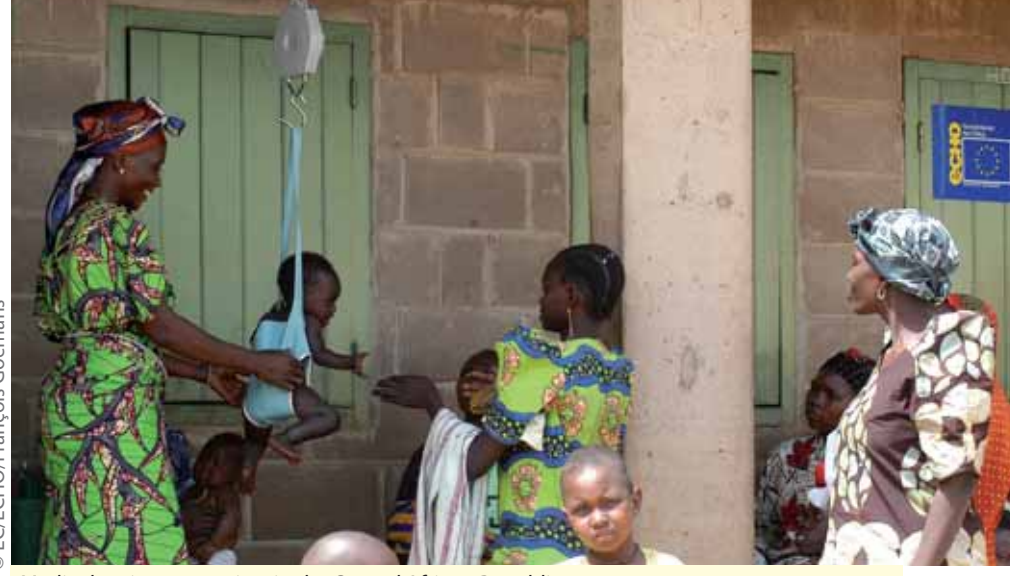
Medical assistance project in the Central African Republic