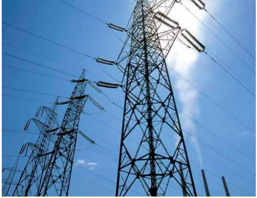
The Energy Partnership seeks to intensify cooperation on energy security and energy access

Maghreb electricity markets' integration project, and explore their possible extension and replication in other African regions;