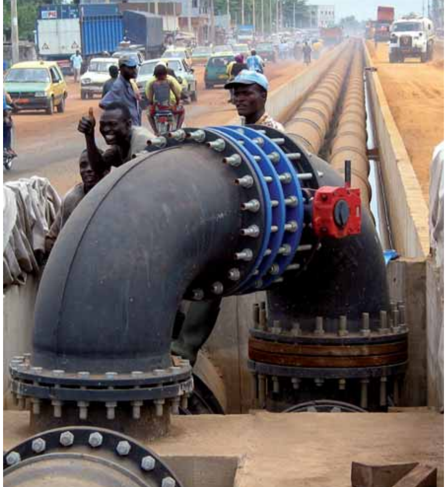
Installing a water conduit in Benin

Water resource management and access to safe water and basic sanitation are crucial both for economic growth and poverty reduction and the achievement of the MDGs. Africa and the EU will therefore work together to further develop the existing EU-Africa Partnership on Water Affairs and