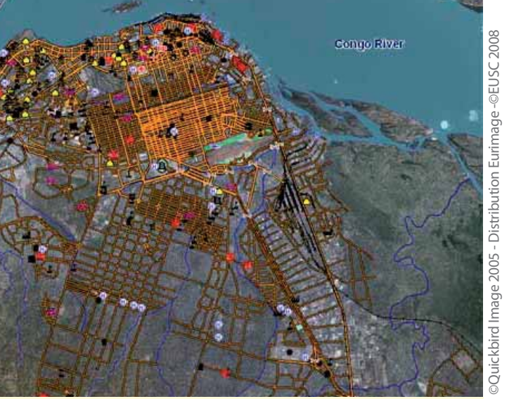
Satellite photo of Kinshasa