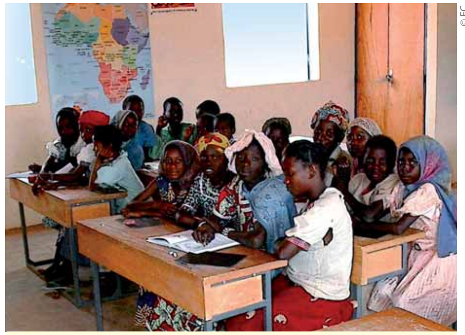
A joint priority for Africa and the EU: to ensure that all girls and boys attend and complete school

Moreover, partners insist on the urgent need to strengthen not only basic education but entire education systems, at all levels. Africa and the EU will together work towards ensuring long-term predictable funding for national education plans to help ensure quality education for all and that all girls and boys attend and complete school, including through the Education for All Fast Track Initiative and the implementation of the Plan of Action for the Second Decade of Education for Africa. Particular attention will be given to the inclusion of hard-to-reach children and children and youth with disabilities.