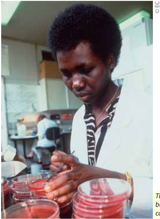
The strategic partnership aims to build scientific and technological capacities in Africa