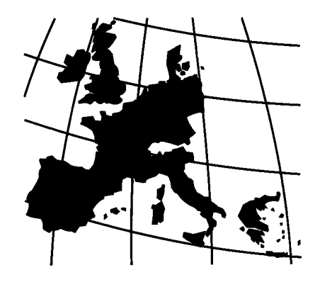
No. 46, Summer 1994

The "Policies" bulletin is compiled on the basis of information provided by national correspondents. It is published in English, French and German.