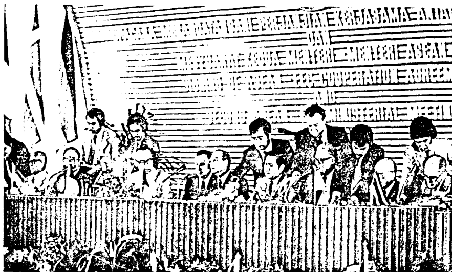
Signing of the E.E.C. — ASEAN economic cooperation agreement in Kuala Lumpur (7 March 1980) From left to right: H.E.'s Rajaratnam (Singapore), Kusumaatmadja (Indonesia), Ruffini (Italy), Datuk Hussein Onn (Malaysia), Rithauddeen (Malaysia) Haferkamp (European Commission), Romulo (Philippines), Sithi Savetsila (Thailand).

the Community plans to hold an industrial conference on a few sectors of mechanical engineering in an ASEAN country.