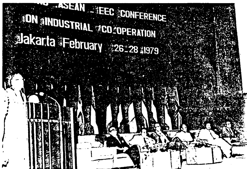
Mr. Wilhelm Haferkamp, Vice-president of the European Commission addresses participants to the ASEAN-EEC industrial conference in Jakarta in January 1979.

The five partners comprise people of different extraction, religion, language and culture. They have different political and economic systems. They have reached different stages of development: the gross national product per capita (1980) varies from 4,129 US dollars in Singapore to 480 US dollars in Indonesia. Thailand was one of the few nations in the Third World able to maintain its independence during the colonial era. The other ASEAN States once form-