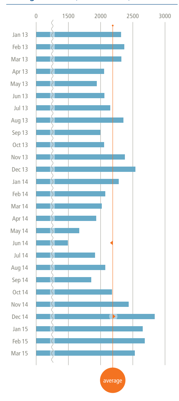
Figure 1: Number of foreign tourists visiting Thailand (in thousands)