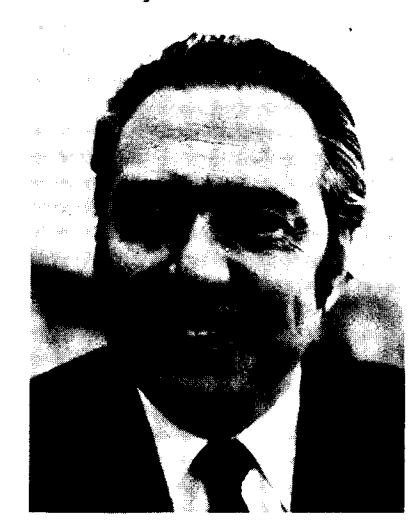
Born 16 February 1925 in Ajaccio, Corsica Married, four children Lycée Albert-Sarraut in Hanoi Law Faculty in Indochina: Law degree