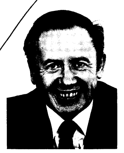
Born 3 September 1928 in Luxembourg Married, one child