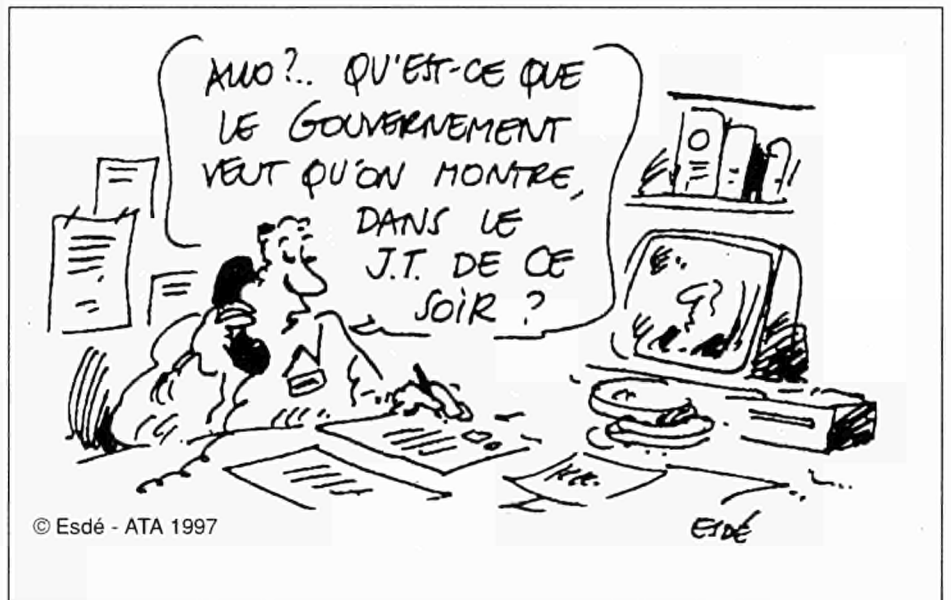
'Hello?... What would the government like us to show on the TV news this evening?'