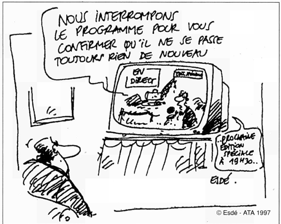
  Esd  - ATA 1997

'We interrupt this broadcast to inform viewers that there are still no new developments... Next newflash at 7.30...'