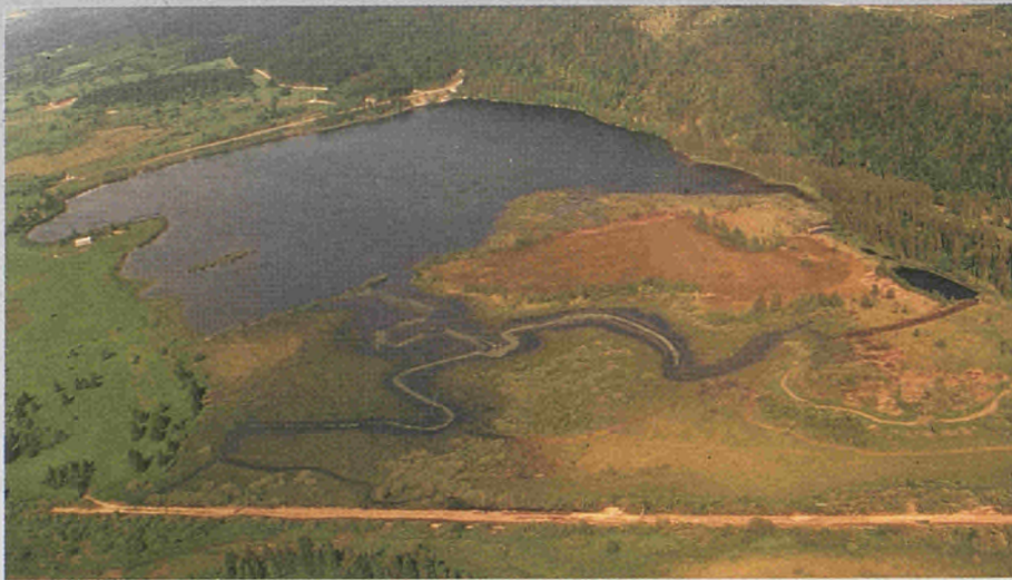
Restoration work in one of the richest areas of the valley, around the lake of Bouverans.