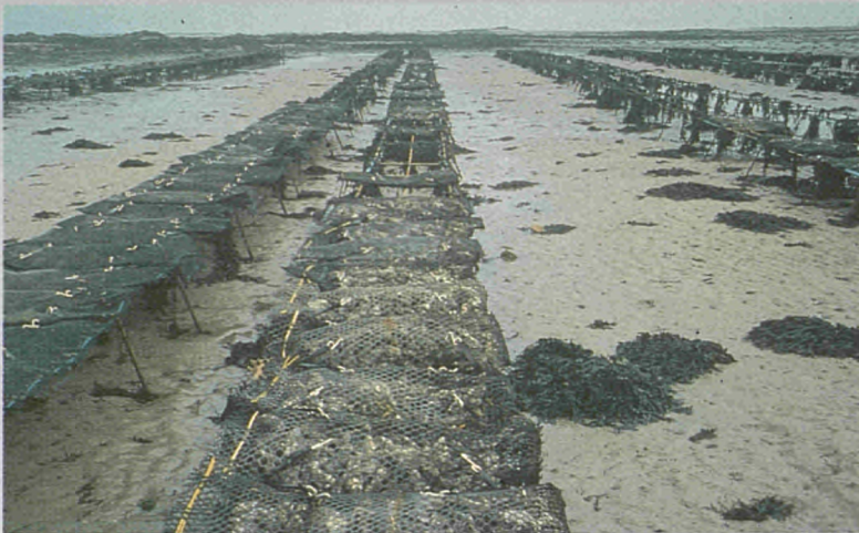
Oyster trestles off the Wash and North Norfolk Coast: proposed SAC.

The particular challenge of implementing the Habitats Directive in marine and coastal areas was the subject of a European seminar held in Morecambe, England on 22 to 24 June 1997. Organised by the Institute for European Environmental Policy, London, the event was supported by various organisations, including DG XI of the European Commission and the UK's Department of Environment, Transport and the Regions, and several non-governmental organisations. The meeting was