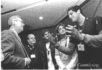
▲ Commissioner David Byrne and the boy band b4-4 promoting the "Feel free to say no" anti-smoking campaign.