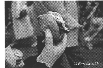
▲ Good food hygiene standards essential for safe food.

The welfare of animals on the farm or in transit and what they are fed are all areas that impinge on food safety and are therefore a primary responsibility of this DG. 2003 should see adoption of revised rules on the protection of animals during transport and there will be initial discussions on new proposals dealing with animal feed. Stringent veterinary controls remain an ongoing priority. These are to be stepped up especially in the light of helping the enlargement countries to get up to speed on the exacting standards of animal welfare required by the EU.