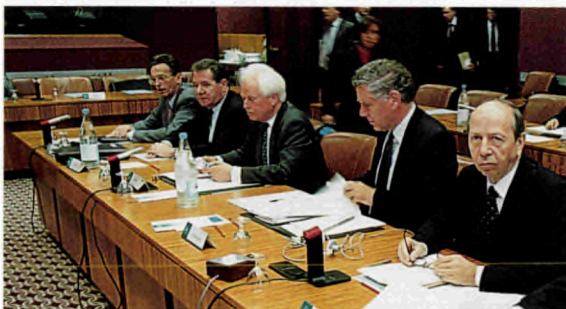
The Annual Meeting of the Board of Governors, chaired by the Governor for Italy, Treasury Minister Lamberto Dini

The Board comprises Government Ministers, usually the Minister of Finance, from each European Union country. Chairmanship of the Board runs from one annual meeting to another in alphabetical rotation of the member countries. The chairmanship until the end of the day of the 1994 annual meeting was held by the Governor for Luxembourg, Jacques Santer, Prime Minister and Minister of the Treasury,