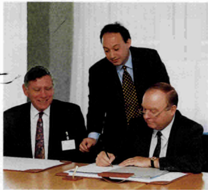
Signature of the co-operation agreement by Sir Brian Unwin and Henning Christophersen

As part of the Union's initiative to stimulate economic growth, employment and competitiveness, the Copenhagen European Council in June 1993 asked for the Edinburgh lending facility (1) to be increased by ECU 3 billion, of which 1 billion for the financing of job-creating investment by small and medium-sized enterprises (SMEs). The European Council asked the Finance Ministers to examine ways of providing an interest subsidy for such lending. The Council of Ministers, in April this year, agreed on a 2% interest rate subsidy and to give the EIB a mandate to administer the facility. European Investment Bank President, Sir Brian Unwin and European Commission Vice-President, Henning Christophersen signed the co-operation agreement for the implementation of the new scheme on 14 June.