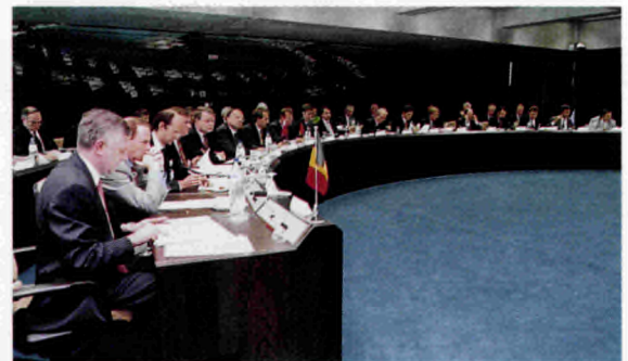
The constitutive meeting of the European Investment Fund

Forecasts suggest that the European Investment Fund will provide ECU 3 to 4 billion in guarantees over the next three