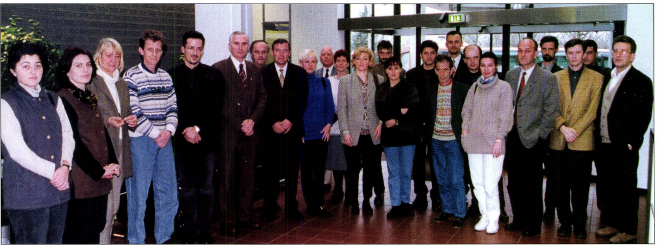
The full team from Bosnia-Herzegovina at Deutsche Telekom's Akademie für Führungskräfte

Period of training: September 1997 to March 1998 Number of training courses held: 33 Total number of managers attending: 298 Average satisfaction rating: 94 percent