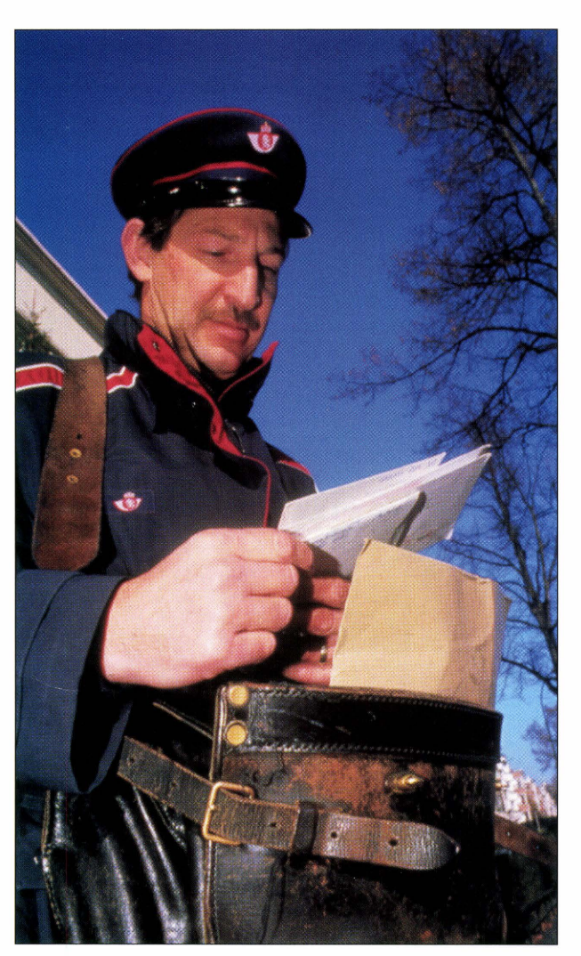
Direct mail provides work for him and his colleagues

s the economies and lifestyles of central and eastern Europe become more like those in the west, there are many ways in which the impact of change will be felt. For the postal organisations there is a great deal of change to deal with. They must make progress in the breadth and standards of service they offer, and the way in which their counter offices present themselves and their organisation to the public. They need to make greater efforts in marketing their services to their existing and potential business customers. They must also learn to use opportunities to influence the way in which their customers think and to ensure that the use of the Post is part of that thinking.