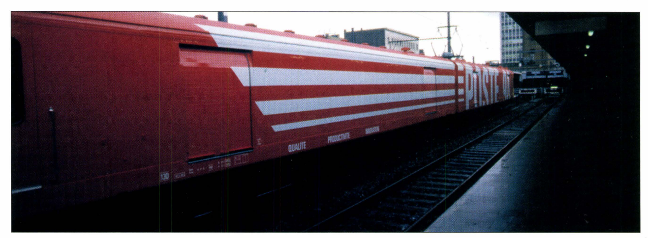
The mail train speeds the mail orders

city to handle much more mail than at present. The transition to market economies offers new ways y Service (BPCS) shows how the Phare programme is helping.